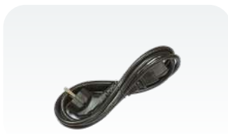
2 Power cords