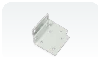
Rackmount bracket white